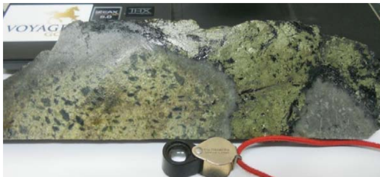
Aranjin – Chalcopyrite Mineralisation (KM0124D-98m)

To date Voyager has completed 29 RC holes, 3 diamond holes and 3 RC holes that have been diamond tailed. Drilling at Aranjin has intersected some of the widest intersections of mineralised hydrothermal breccia reported to date on the KM Project, including: