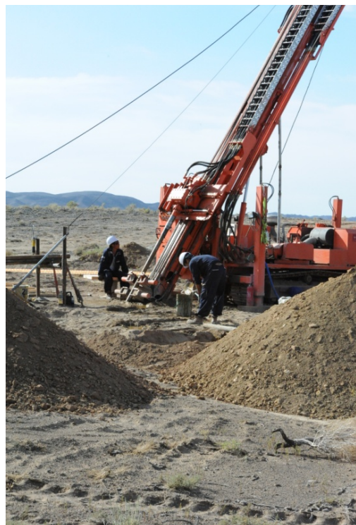
Gaans – Diamond Drilling September 2011

At KM these hydrothermal magmatic breccias are the most common host of mineralization. The breccia outcrops have now been mapped over a 5 km east west corridor within the interpreted “Mega Breccia” complex. The Cughur deposit lies adjacent to the western extent of the “Mega Breccia”, whilst the Zuun Umnuh Prospect (far southeast, yet to be drilled) is the easternmost extent of the breccia. Gaans occur approximately in the middle of the mapped east west extent. The north south extent of the breccia outcrops varies but could exceed 800 metres in both the western and eastern sectors.