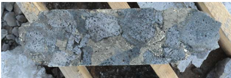
Gaans – Chalcopyrite Mineralisation in Breccia (KM0068D)

diamond core and two Reverse Circulation (RC) drill rigs. Drilling is focusing on extensions to previously intersected and reported mineralisation and delineating the spatial and depth extents of the system at Cughur and the recently discovered Gaans. Further drill testing of exploration targets within the project is also being carried out at the Aranjin, Elstei and Zam Daguukh Prospects. Voyager has also commenced exploration (IP Deeps programme) for mineralisation at depth and the potential for “feeder” systems to the mineralisation that has been intersected at or near surface.