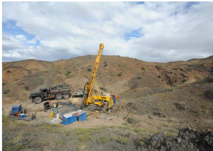
Diamond Drilling Khongor – October 2011

Voyager also completed a number of geophysical and geochemical surveys at Khongor during the quarter, including